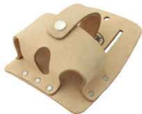
TGM-28112 Tape Holster