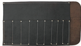
TGM-28118 Chisel Roll 10 Pocket Oil Tanned Finish