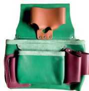
TGM-30128 Electrician Tool Pouch Top Grain Leather