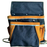
TGM-30207 Nylon & Leather Tool Pouch