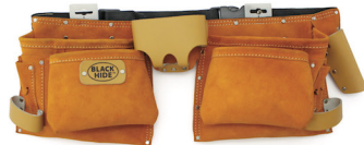
TGM-28103 (S) 11 Pocket Split Leather Tool Pouch

Choose Your Color : Yellow / Brown / Black