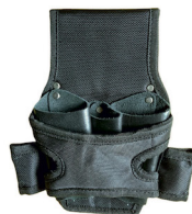
TGM-30174 Nylon & Leather Tool Holder