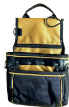
TGM-30166 Nylon Electrician Tool Pouch