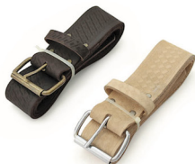
TGM-28116 2 Inch Leather Embossed Belt