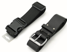
TGM-28119 Heavy Duty Nylon Belt