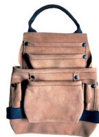
TGM-30205 Electrician Pouch Split Leather with Handle