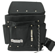
TGM-28120 Electricians Nylon Tool Pouch with Handle & Belt