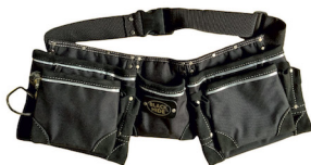
TGM-30159 Nylon & Leather Carpenter Apron